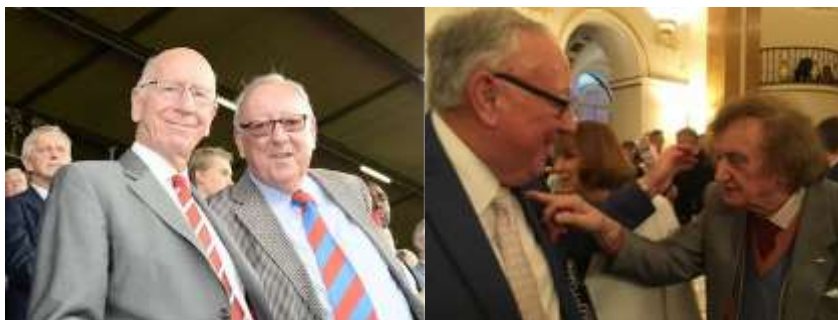
He was at Manchester United with Sir Bobby Charlton for his 80 th birthday and Sir Ken Dodd at his 90 th Birthday Lunch.